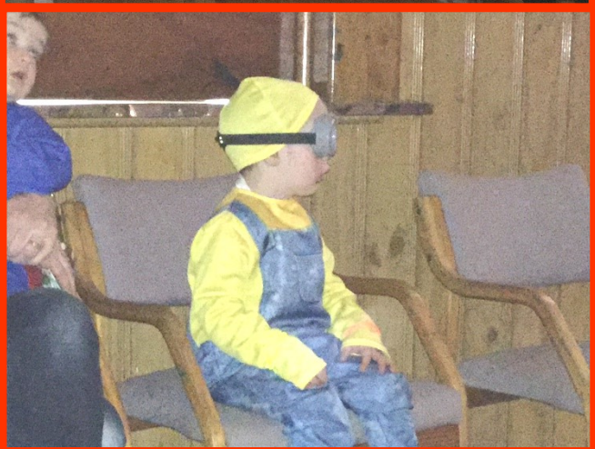
WAIKITE VALLEY SCHOOL HALLOWEEN DISCO—2016